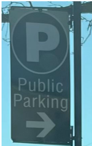
Figure 3 - Not present for Lot I.