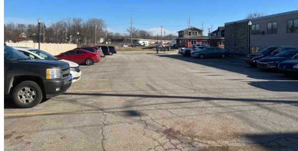
Figure 2 - looking west.