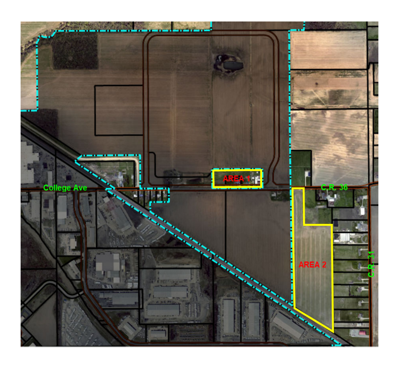
EXHIBIT A College Avenue (County Road 36) Annexation Area Map