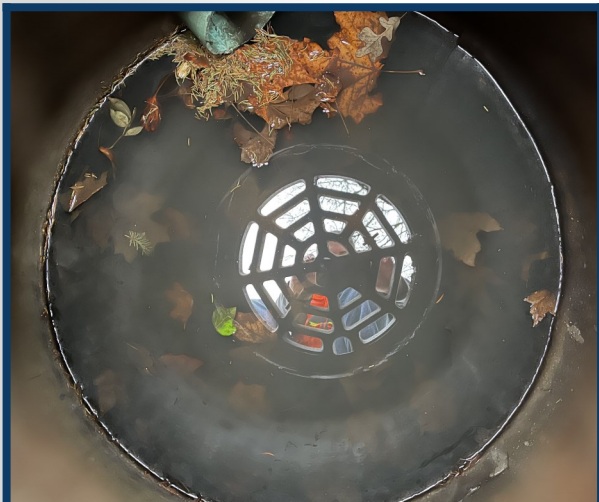
Water discolored by dumped grease.