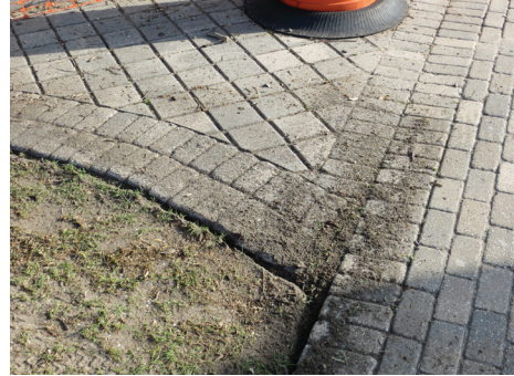
5 UNSTABLE DRAINAGE AREA