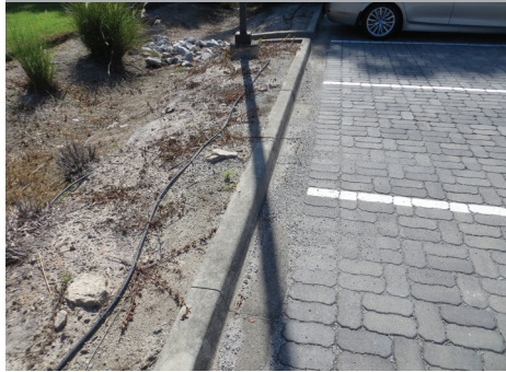
5 UNSTABLE DRAINAGE AREA