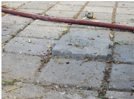
8 STRUCTURAL & 15 SEDIMENT (POOR)