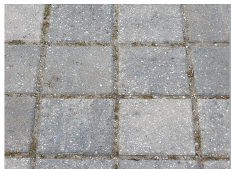
15 SEDIMENT (POOR)