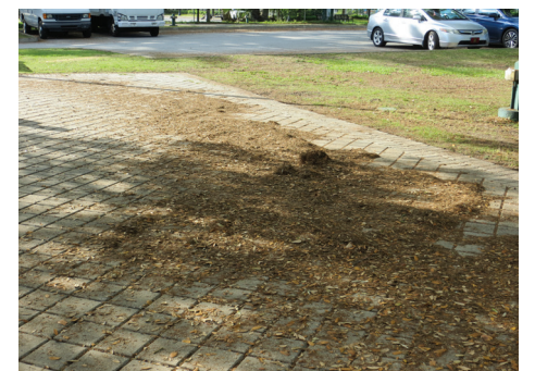
16 DEBRIS (POOR)