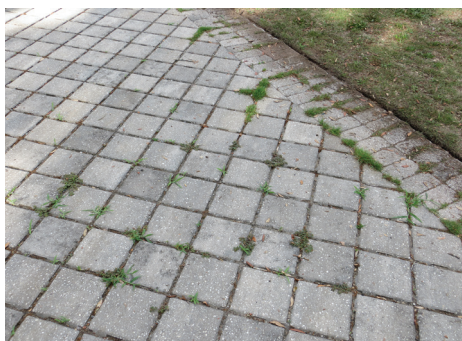
14 VEGETATION (MARGINAL)