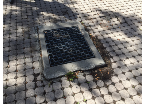
7 SETTLING & 15 SEDIMENT