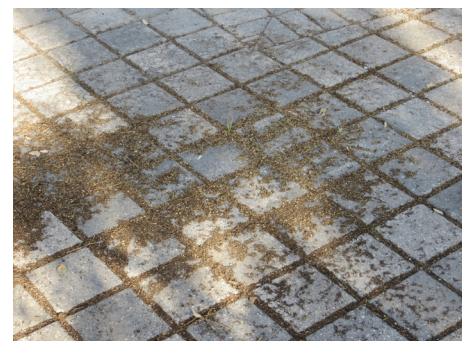
16 DEBRIS (POOR)