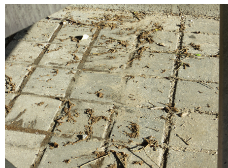
15 SEDIMENT (POOR)