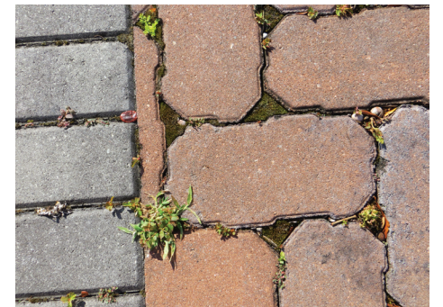
14 VEGETATION (POOR)