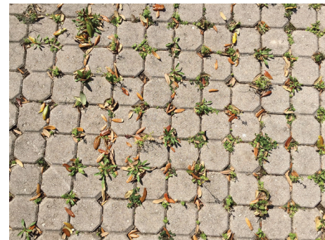
14 VEGETATION (POOR)