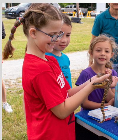
Learning about local wildlife with the Elkhart County Parks Department

The Stormwater Department is excited to report the success of the first ever Water Fest hosted in Mill Street Park on Goshen's northside. The event featured food vendors, music from Radio Horizonte, a dunk tank, and watershed education partners coming together to spread awareness about our water resources and efforts to protect them.