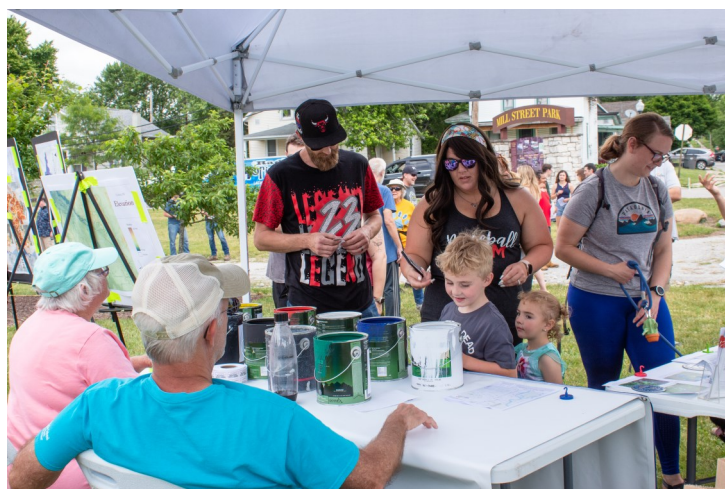
Voting for their favorite mural this year