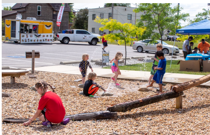
The bubbling rock play area was a big hit with the little ones