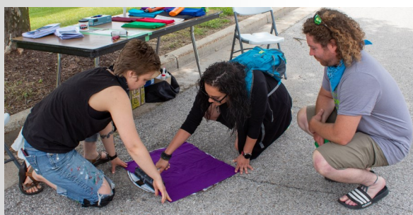
Short Stack Press led storm drain art print making