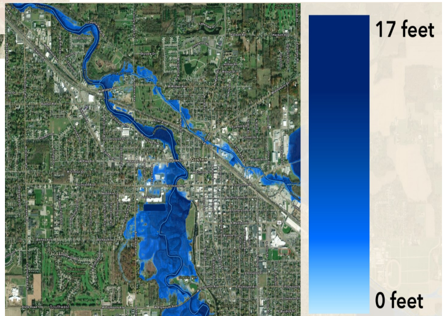
Flood depths during a 0.2% annual chance flood event with the darkest blue at approximately 17 feet.