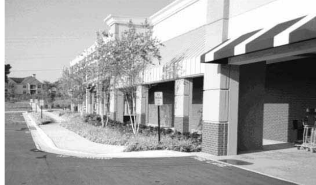
Example of Foundation Landscaping