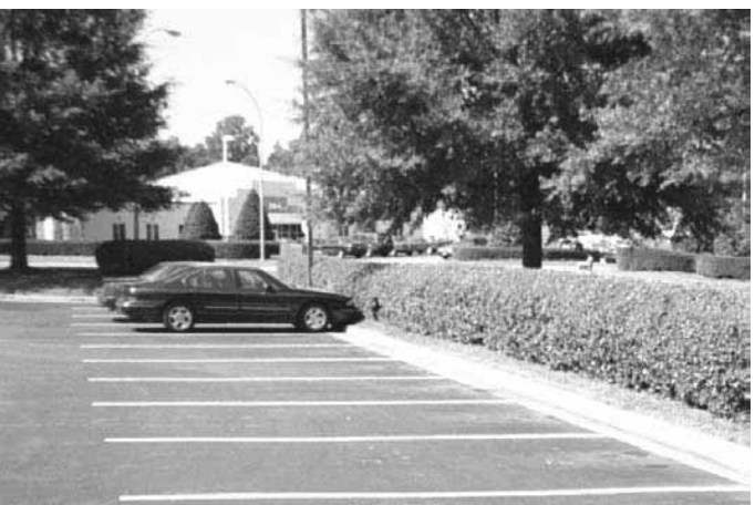
Example of Off Street Parking Area Landscaping

All new off-street parking areas containing thirty (30) parking spaces or more and all off-street parking areas which are increased, after the effective date of this ordinance, by thirty (30) parking spaces or more, whether such increase occurs at one (1) time or in successive stages, shall be subject to the following landscape regulations: