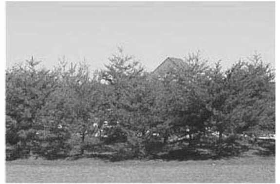
Example of Type C: Full Screening Landscaping