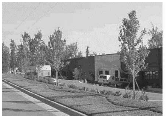
Example of Type A – Open Landscaping