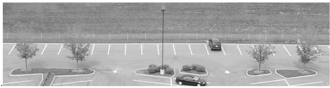
Example of Off Street Parking Area Landscaping

F. Groundcover shall make up the balance of the landscape islands or peninsulas