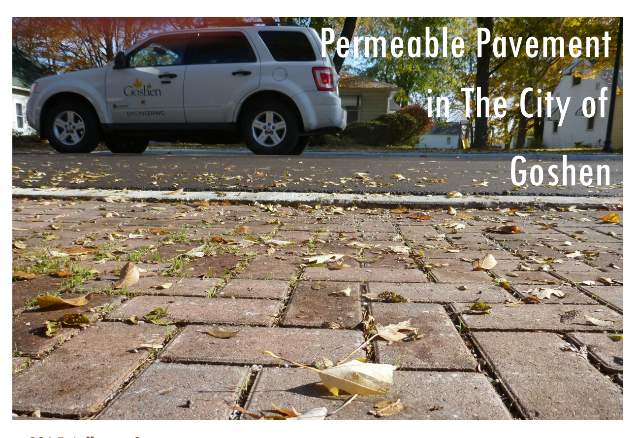
204 E. Jefferson Street Goshen, Indiana 46528 The Elkhart River Watershed