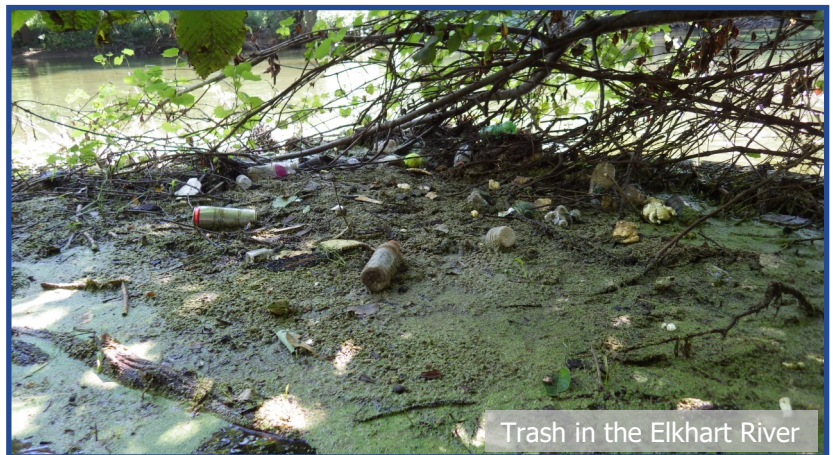
Trash in the Elkhart River

Even though Goshen is located hundreds of miles from the ocean, we are only about 91 miles from Lake Michigan as the water flows. Plastic trash is visible on our City streets daily and eventually flows into our local waterways, which flows to Lake Michigan, an ultimately is connected to the Atlantic Ocean.