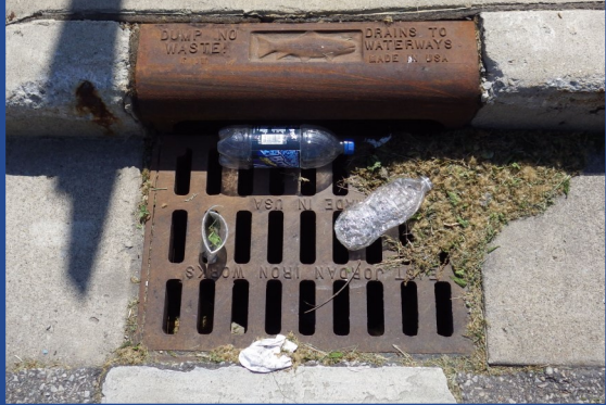
Plastic Debris on a City Storm Drain

Even though Goshen is located hundreds of miles from the ocean, we are only about 91 miles from Lake Michigan as the water flows. Plastic trash is visible on our City streets daily and eventually flows into our local waterways, which flows to Lake Michigan, an ultimately is connected to the Atlantic Ocean.