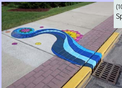
Carrie Beachey (100 block of S. 2nd St.) Sponsor: RC3 Realty